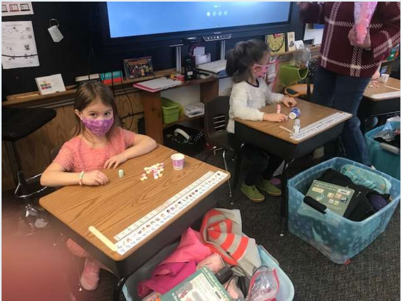
Pictured above are first grade students engaging in Valentine's themed games.

It was great to be able to hold Valentine's exchanges this year in the WCS classroom. Last year, students were unable to exchange Valentine's cards due to Covid-safety protocols. Students had lots of fun playing Valentine's themed games, creating friendship cards and letters as well eating special treats.